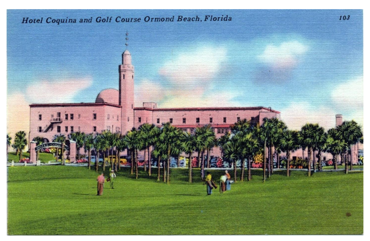
Hotel Coquina and Gulf Course, Ormond Beach, Fla. - ca. 1957.