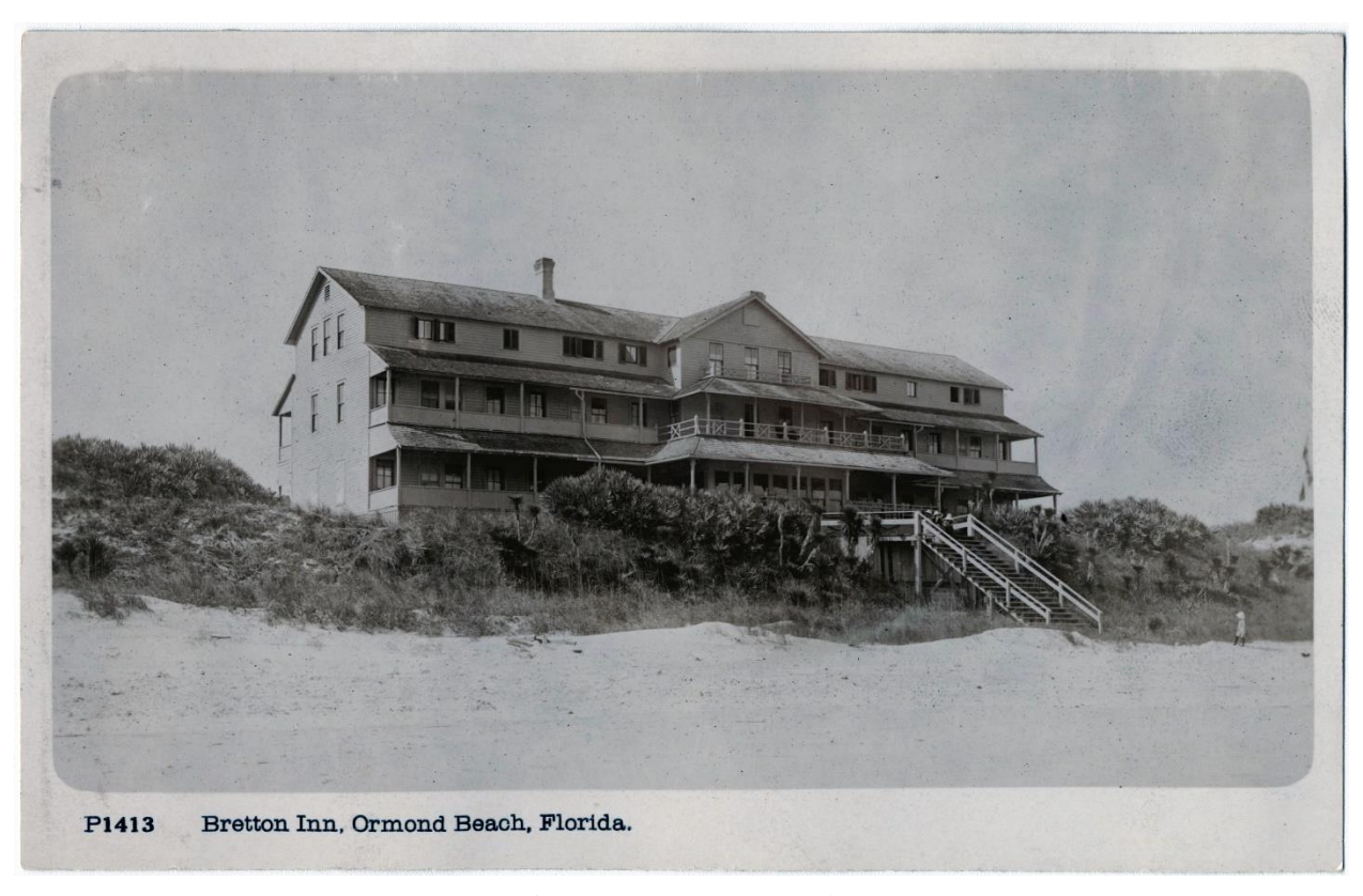
Bretton Inn, Ormond Beach, Florida - ca. 1920.

Now more than 50 years since the razing of Ormond Beach's Coquina Hotel, a once nationally recognized landmark, memories of the structure are quickly fading into the annals of history.