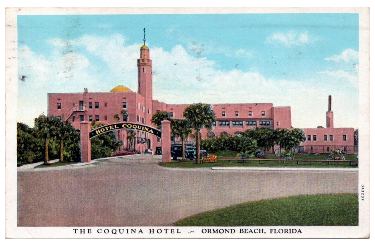
The Coquina Hotel, Ormond Beach, Fla. – ca. 1932.