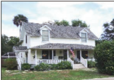
Allen Home ~ 31 Lincoln