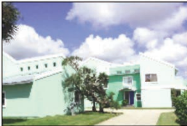
Chapin Home ~ 153 Neptune