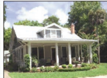
Stockman Home ~ 61 Lincoln