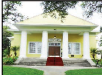
Anderson-Price Memorial Building