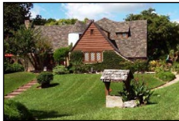
La Tourette c. 1928