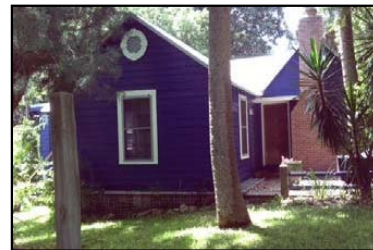
121 Orchard Lane c. 1890's