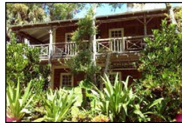
Talahloko c. 1886