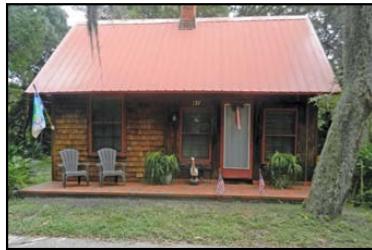
Nathan Cobb Cottage c. 1897