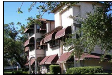
The Casements c. 1913

Reserve your tickets now! Limited number available.