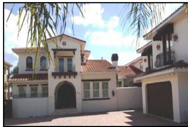
347 North Beach Street