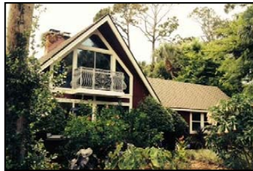
166 Orchard Lane c. 1966