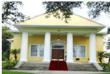
Anderson-Price Memorial Building c. 1916